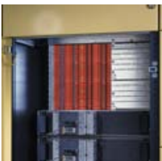
Reserve space available for future equipment